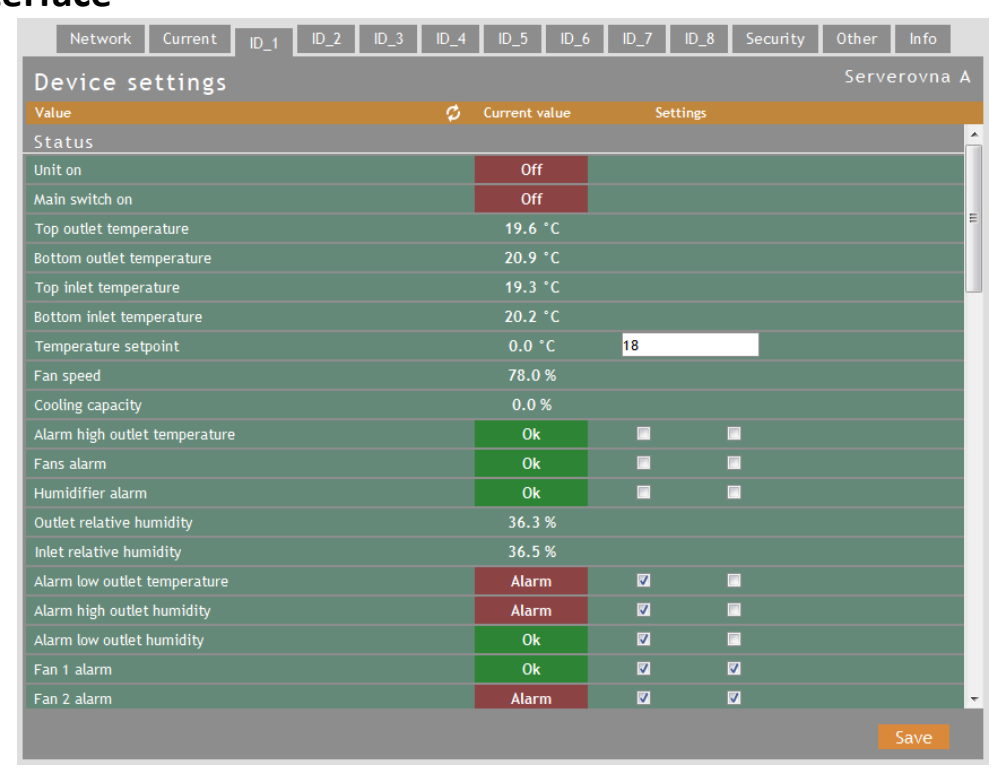
Sample web interface